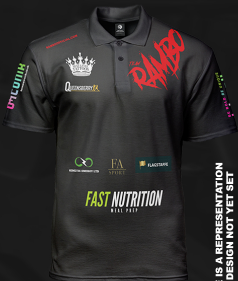
IMAGE IS A REPRESENTATION FINAL DESIGN NOT YET SET

MAIN PARTNER ▲ CORPORATE | BRAND ENGAGEMENT